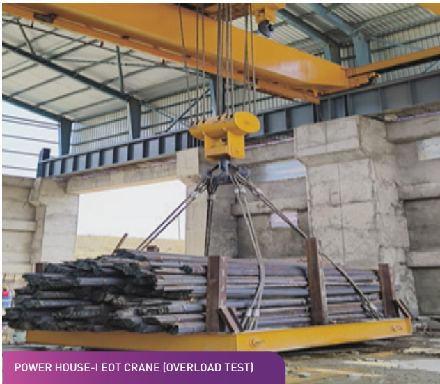
POWER HOUSE-I EOT CRANE (OVERLOAD TEST)