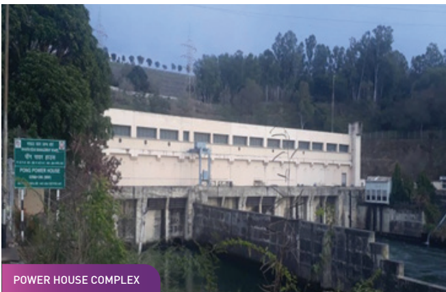
POWER HOUSE COMPLEX