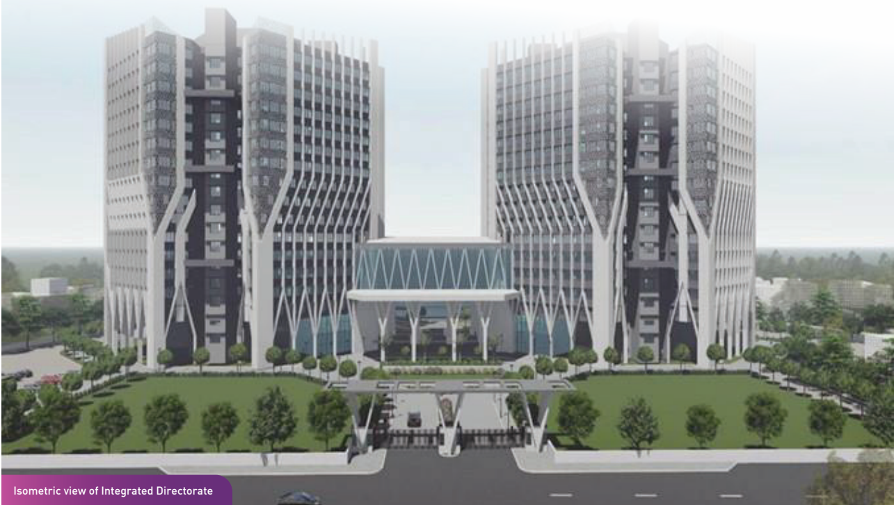
Isometric view of Integrated Directorate