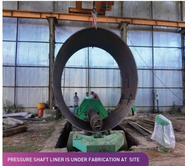
PRESSURE SHAFT LINER IS UNDER FABRICATION AT SITE