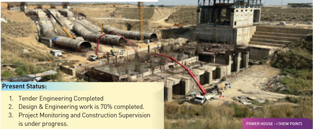
POWER HOUSE - I (VIEW POINT)