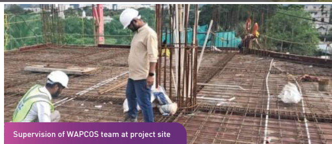
Supervision of WAPCOS team at project site