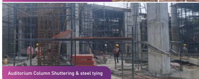
Auditorium Column Shuttering & steel tying