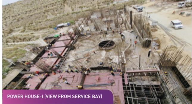
POWER HOUSE-I (VIEW FROM SERVICE BAY)