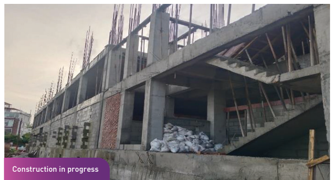
Proposed building of Union bank of India, Dehradun