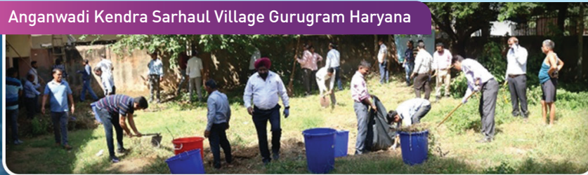
Anganwadi Kendra Sarhaul Village Gurugram Haryana

team took the Swachhata Hi Seva pledge, reinforcing their commitment to cleanliness and community welfare. In addition to the activities at the Anganwadi Kendra, WAPCOS conducted cleaning initiatives at its Gurgaon and Kolkata offices, ensuring a clean and healthy workspace for all employees. Furthermore, the team undertook cleaning and maintenance activities for solar panels at the center, underscoring the importance of sustainable energy solutions. This initiative contributed to a cleaner environment while supporting the broader mission of building a Swachh Bharat.