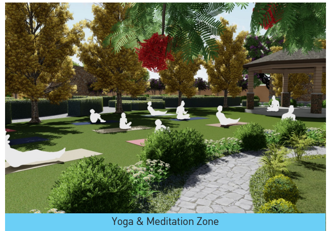
Yoga & Meditation Zone