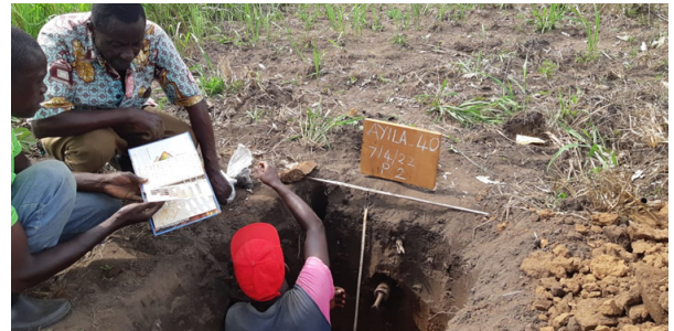
Ongoing Geotechnical Investigations-Core Drilling

The objective of the project is to sustainably improve the living conditions and incomes of poor farmers and their households in the proposed irrigation schemes and the surrounding watersheds.