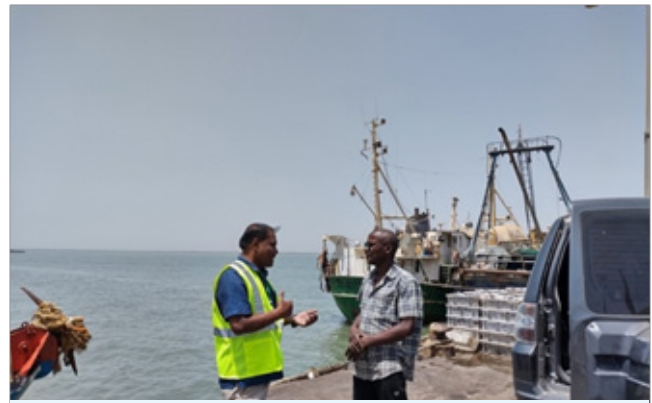
Site Visit and Interaction with Stakeholders

In this regard, GPA has appointed WAPCOS Limited for the preparation of the ESMP and RAP reports to address all the environmental and social safeguard issues due to the various developments proposed at the Port of Banjul in compliance with the requirements and regulations of the AfDB's Integrated Safeguards System (ISS) and the EIB's Environmental and Social Standards (ESS), and the regulatory requirements of the Government of The Gambia.