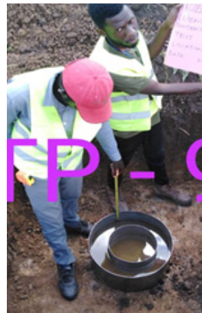
Trial Pits- Infiltration Test