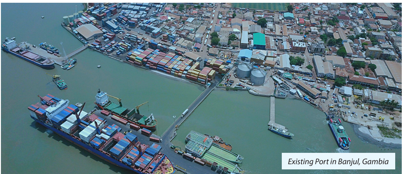
Existing Port in Banjul, Gambia

The Final ESMP and RAP report has been approved by National Environmental Agency (NEA) of Gambia and the report has been made for public disclosure on the African Development Bank's website as part of the funding requirements on 25.07.2022.