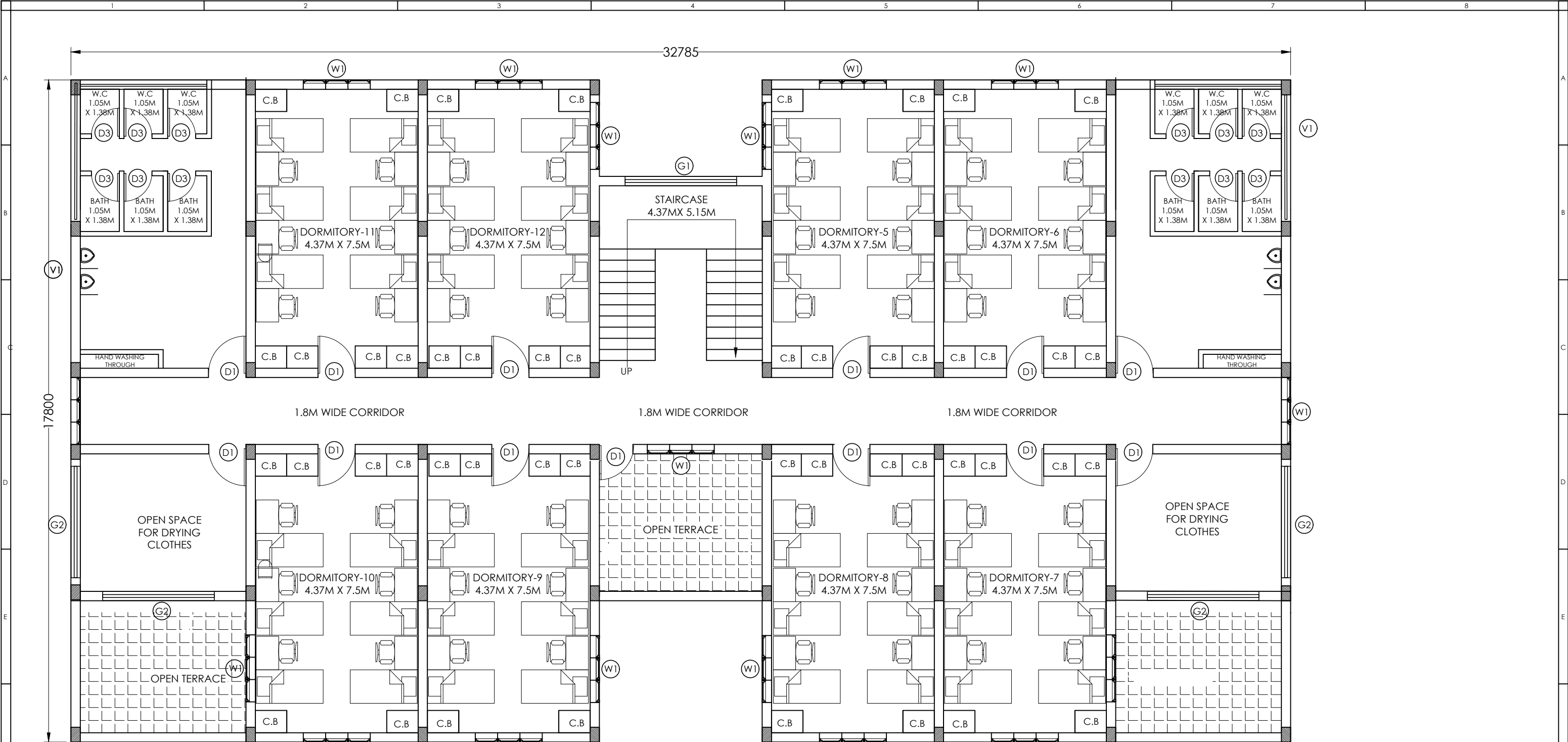
SECOND FLOOR PLAN AREA-502 SQM