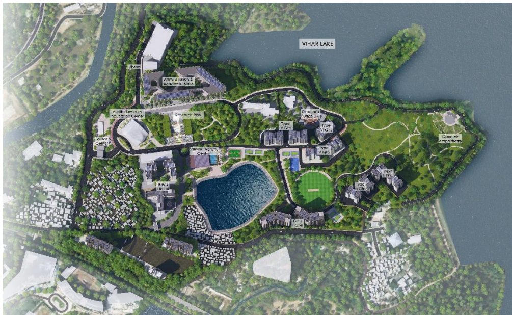
Conceptual Masterplan of the Campus

The site's varied topography, characterized by significant changes in elevation, poses a challenge for the design of an accessible and cohesive campus. Steep slopes can complicate construction and make certain areas difficult to access. The designs can accommodate the natural slopes while creating dynamic and visually interesting spaces. Accessibility can be ensured through the careful placement of ramps, elevators, and accessible paths. The use of retaining walls and graded landscaping can help to stabilize slopes and prevent erosion, while also providing opportunities for outdoor classrooms, amphitheatres, or other unique campus features that take advantage of the natural terrain.